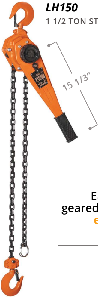
LH150 1 1/2 TON STANDARD LEVER